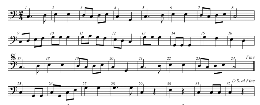
Play 1-32. At the D.S. al fine, go back to the sign and play to the double bar. So, play 1-32, 17-24.